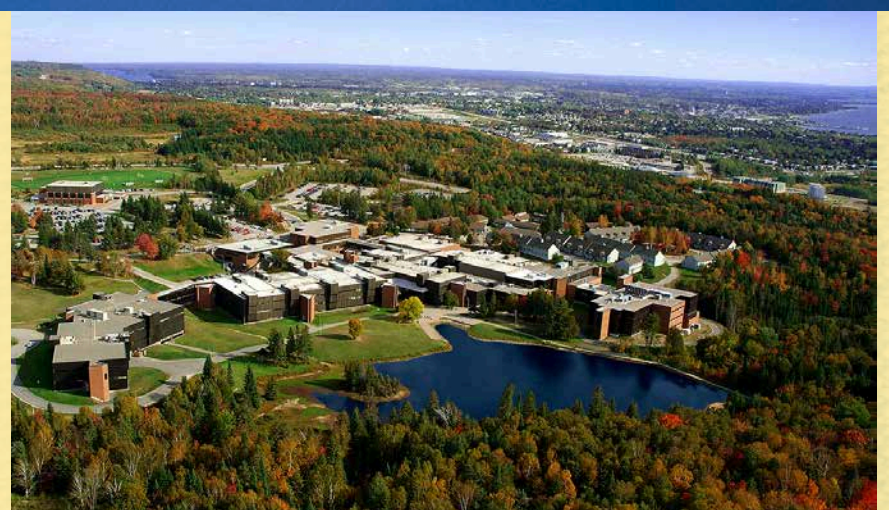
Canadore College and Nipissing University share a 760-acre campus, complete with a man-made lake. Head up College Drive one day to look around, if you haven't ever seen this great campus.

Colleges and universities can use the funding for projects that support the renewal and modernization of campuses including major building systems upgrades, heating and ventilating system upgrades, and mechanical and electrical system upgrades. The funds can also be used to purchase instructional equipment and materials, such as new computers and software for teaching purposes, specialized equipment, or machinery for use in labs and classrooms, and tools for shops.