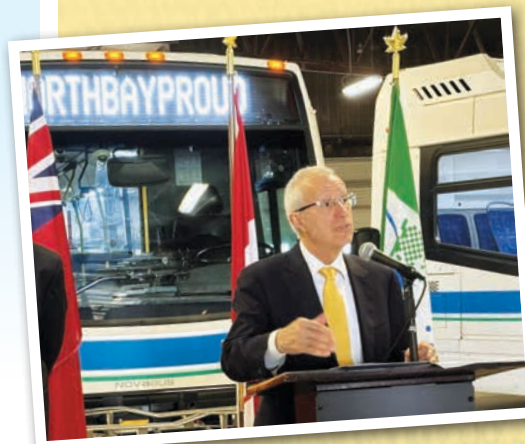
Nipissing MPP Vic Fedeli at the podium announcing millions of dollars of Transit Funding for the City of North Bay, including new hybrid buses, transit equipment, an upgraded Transit Terminal, and Gas Tax funding.

It also includes the retrofit the Transit Terminal with a video screen displaying arrival times alongside upgraded heating, ventilation, and air conditioning systems to enhance the customer experience. In addition, the Ontario government is supporting the City of North Bay with $785,000 from the Gas Tax program. The funding can be used to expand service hours, increase routes, purchase new vehicles, and improve accessibility to increase transit ridership.