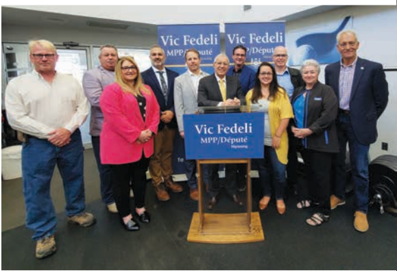
NOHFC Business announcement at Martel and Mitchell Rehabilitation

The Ontario government invested $5.5 million to support economic development projects through the Northern Ontario Heritage Fund Corporation (NOHFC). These investments will help businesses expand operations, hire interns, and develop Nipissing's workforce.