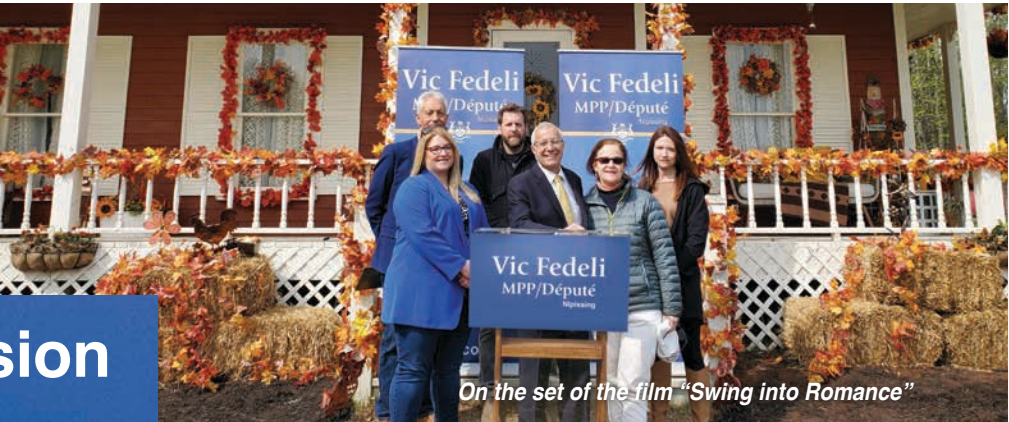
On the set of the film "Swing into Romance"