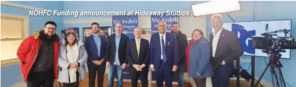
NOHFC Funding announcement at Hideaway Studios