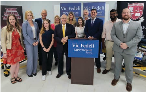
At CTS Canadian Career College for the NOHFC Intern announcement