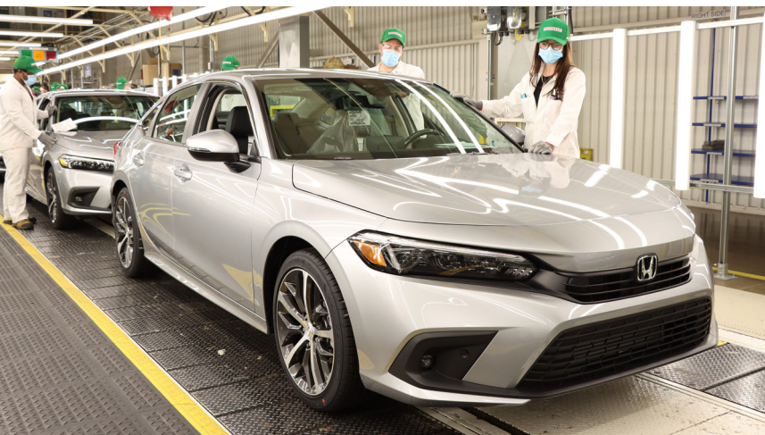
Building cars in Alliston since 1986, Honda continues to produce their CR-V SUV and the Civic – Canada's best-selling car for the past 23 years.

These investments follow Toyota's $1.4 billion upgrade to their Cambridge and Woodstock facilities that will establish Ontario as their manufacturing hub for its best-selling Rav4 crossover, and to bring Lexus NX production here. And Honda, which started building cars in Alliston in 1988, continues to produce their CR-V SUV and the Civic; Canada's best-selling car for the past 23 years.