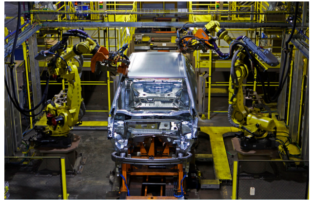
Ford has announced a $1.8B investment to produce battery EVs at its Oakville assembly complex, including the production of 5 new EV models.

In addition to securing new OEM production mandates, we will use our critical mass to drive the industry's transition and growth, including becoming a significant player in EV battery manufacturing, and exporting more Ontario-made auto parts and innovations. The province supports the transformation of the supply chain and the creation of a domestic