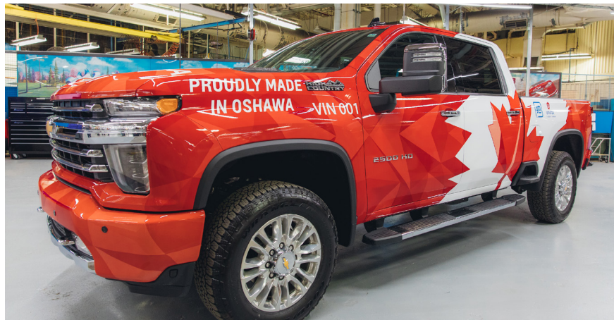
GM has invested $1.3B to resume pickup truck production in Oshawa, with the first Chevrolet Silverado already rolling off the assembly line.

The recent streak of investment announcements in EV development and production in the province makes it clear – Ontario is open for business.