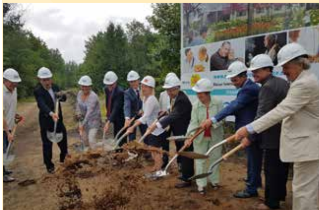
Les représentants locaux et de l'hospice lors de la cérémonie d'inauguration du site de construction de la Maison Sérénité du Nipissing.